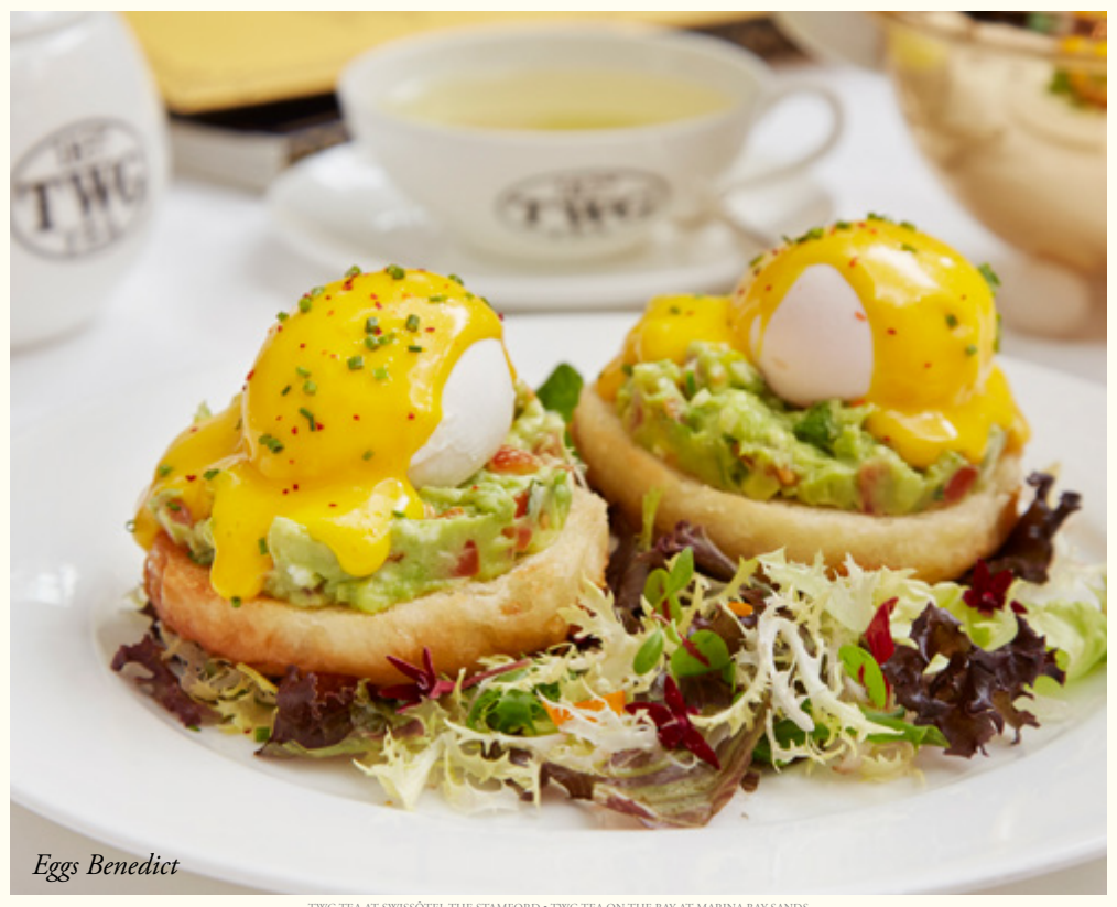
TWG TEA AT SWISSOLEL THE STAMFORD * TWG TEA ON THE BAY AT MARINA BAY SANDS TWG TEA GARDEN AT MARINA BAY SANDS * TWG TEA AT TAKASHIMAYA L2 * TWG TEA AT ION ORCHARD * 27 MARCH 2024

Spaghetti tossed with rich winter truffle and garlic cream, accompanied by mushroom Duxelle and crunchy asparagus, served with a soft cooked free-range egg topped with Genmaicha furikake.